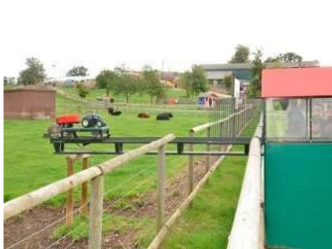
Above: Food is placed in the trailer and by turning the handle the tractor and trailer back out and the food is tipped from the trailer for the cattle.