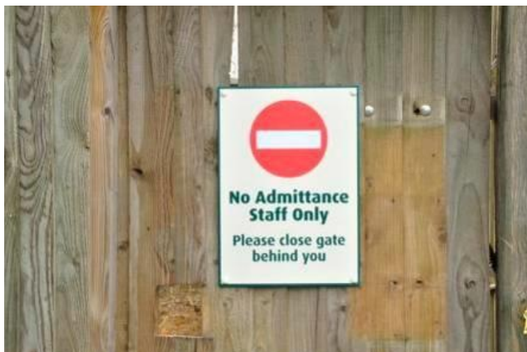
Left: Clear sign on locked gate