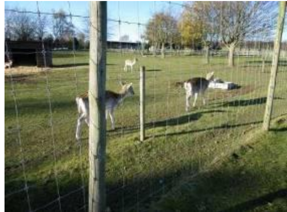
Above: Example of double fencing, high and low stock fences. Visitors can still view the animals safely.

Children can still enjoy feeding animals in “non-contact” areas and “look and see” areas