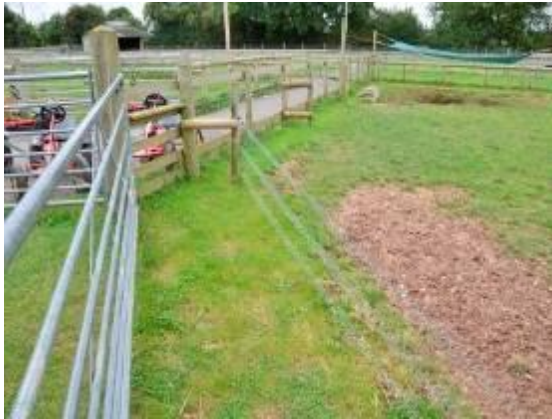
Above: Example of double fencing, stock and electric fences used together.