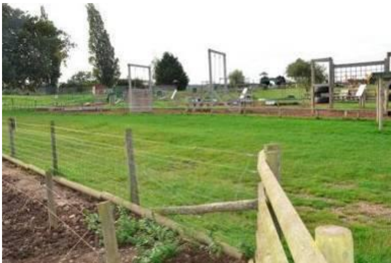
Left: Double fencing between play areas and areas containing animals.