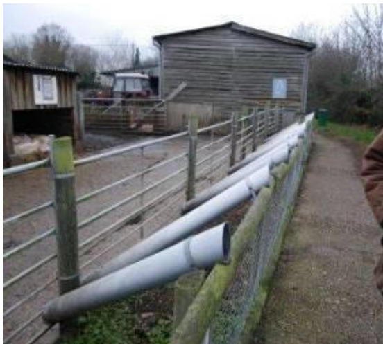
Above: Food is allowed to slide down the pipe into the pen for pigs.

Children can still enjoy feeding animals in “non-contact” areas and “look and see” areas