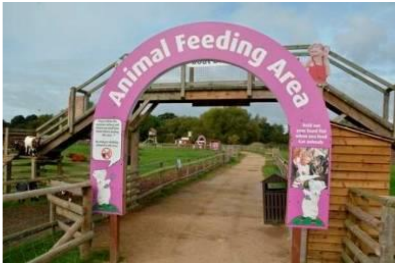
Left: Well signed entrance to animal feeding area