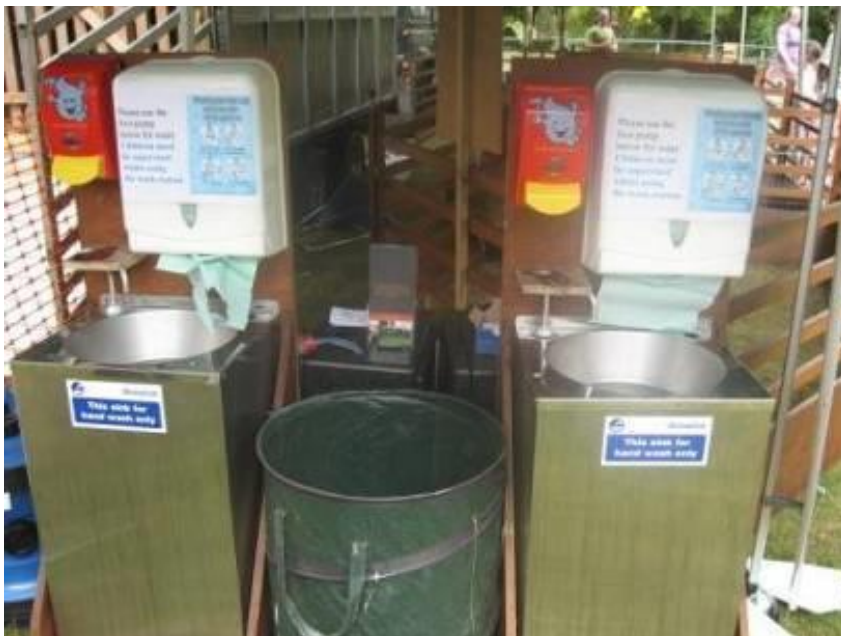
Left: An example of a hand wash station on mobile petting attraction. Soap, water, paper towels and bins are all provided.